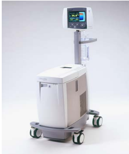
CoolGard 3000 ® system measures patient temperature and sends cooled saline to catheter.

Blood is cooled as it passes by the balloons. No fluid is infused into the patient, nor is blood circulated outside of the body.