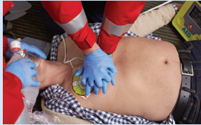
ZOLL's RapidShock™ Analysis provides heart rhythm analysis in as little as 3 seconds for more continuous CPR.