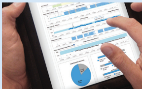
Wi-Fi and USB Connectivity enable quick and easy access to event data.