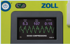
ZOLL's CPR Dashboard™ provides real-time numerical feedback on CPR depth, rate, and cycle time.