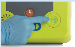
Activate Child Mode to invoke the paediatric heart analysis algorithm and reduce energy delivered.